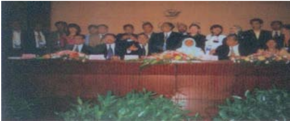
Business Meeting in China