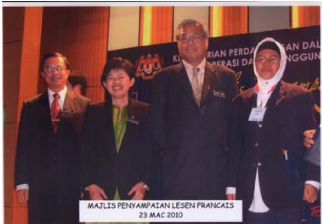
With Minister of Domestic Trade, Co-operative and Consumerism (MDTCC)