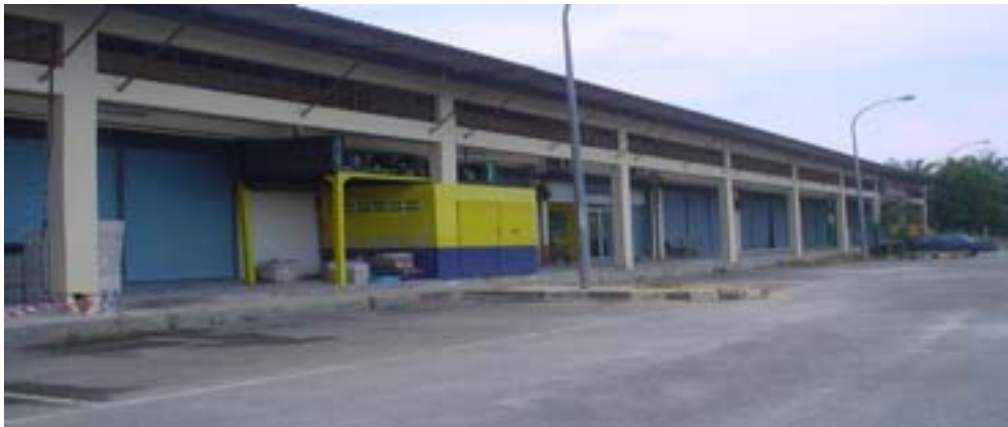
Right side of the Factory