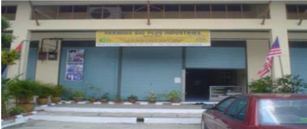
In front of the Factory