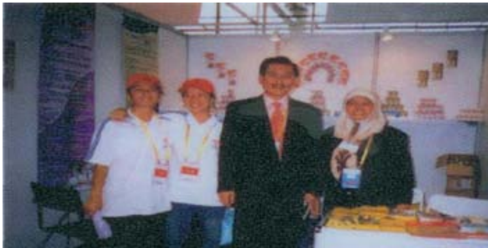
With Former Minister of Health in Naning